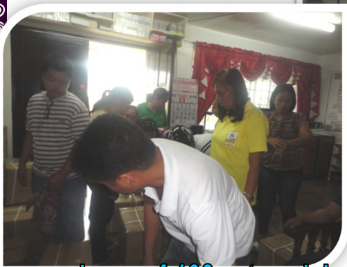
..release of 100 set modules to ALS Implementers