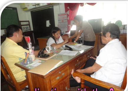
..coordination with the Service Provider Focal Person