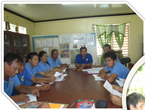
Attended Barangay Session