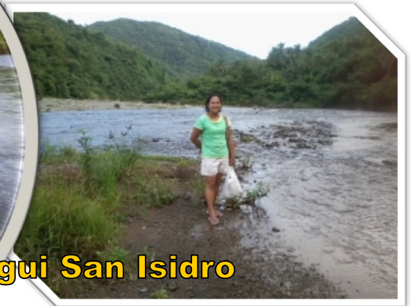
..to Dugui San Isidro