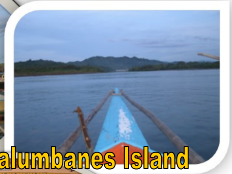
..to Palumbanes Island