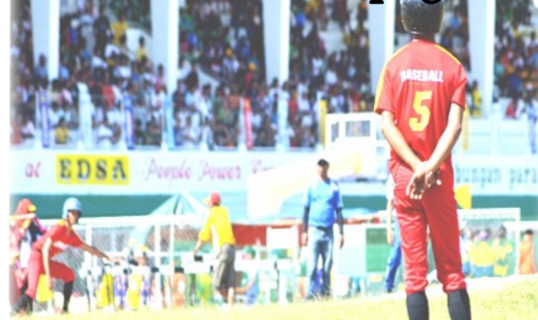
FIELD OF DREAMS. No. 5 is awestruck by the sizeable crowd that had gathered at the Catanduanes Sports Complex to watch the ongoing games, far from the near empty and rutted playing field where he is king back home.