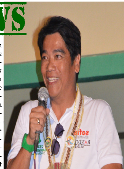
GRAND PLANS. The congressman from the lone district of Catanduanes in cooperation with DepEd will embark on a mission to bring Palarong Pambansa to the island in a couple of years.