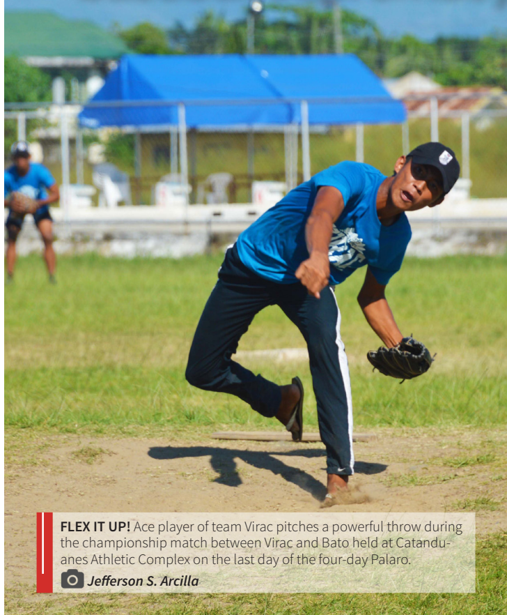
FLEX IT UP! Ace player of team Virac pitches a powerful throw during the championship match between Virac and Bato held at Catanduanes Athletic Complex on the last day of the four-day Palaro.