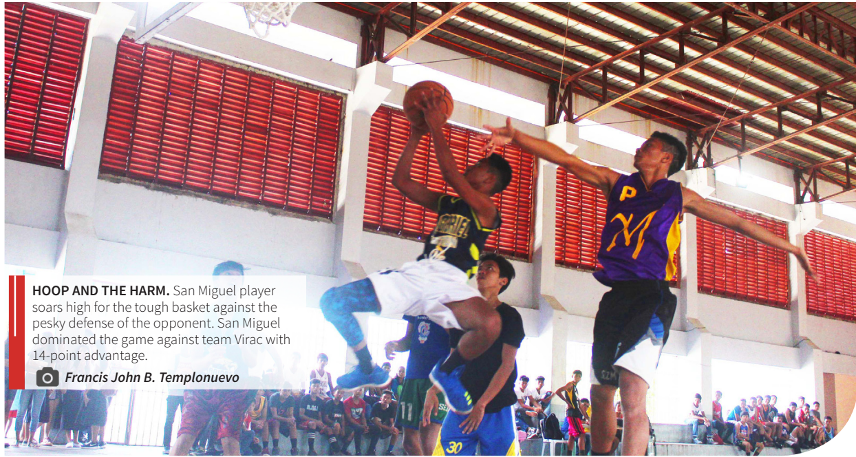
HOOP AND THE HARM. San Miguel player soars high for the tough basket against the pesky defense of the opponent. San Miguel dominated the game against team Virac with 14-point advantage.