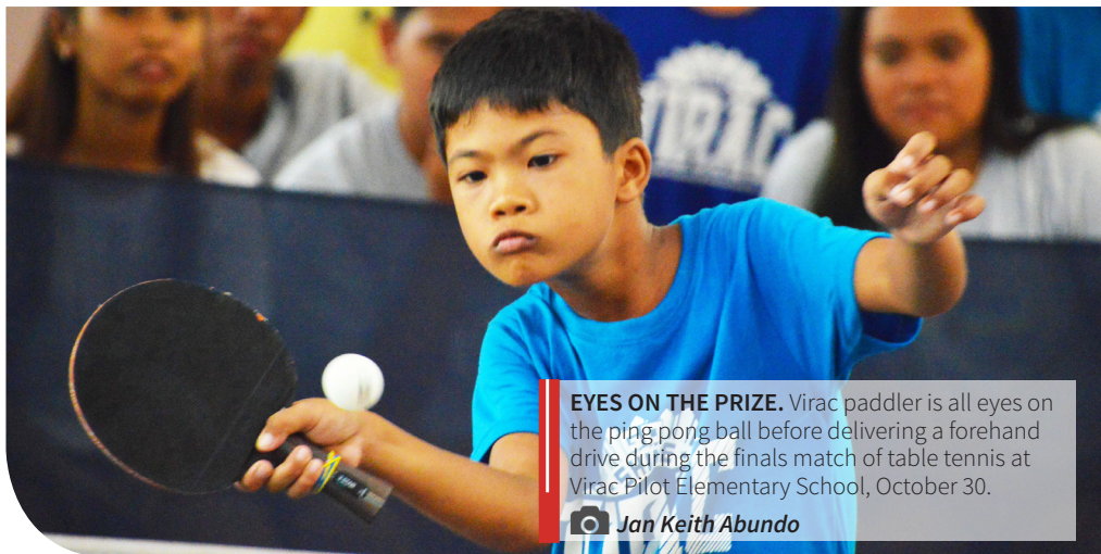
EYES ON THE PRIZE. Virac paddler is all eyes on the ping pong ball before delivering a forehand drive during the finals match of table tennis at Virac Pilot Elementary School, October 30.

"An saindong disiplina sa sports iyo an dadalhon nyo pag kurang niyo. Dai problema sako manggana man o madaog, ako pilang beses naman nadaog. Maski an bronze medal na ito kan last 2013, an score ko zero. An kalaban ko six footer na Koreano. Isipa daw kun pilang beses ako sinipa sa payo. Ang importante diyan pag paribod mo, kapot-kapot mo an bronze medal mo, isipon mo na ikan kang balon na adal. Mapunta ako utro sa gym, mapraktis ako utro, ta isi ko kun ano an sakuyang salang ginibo," he revealed.