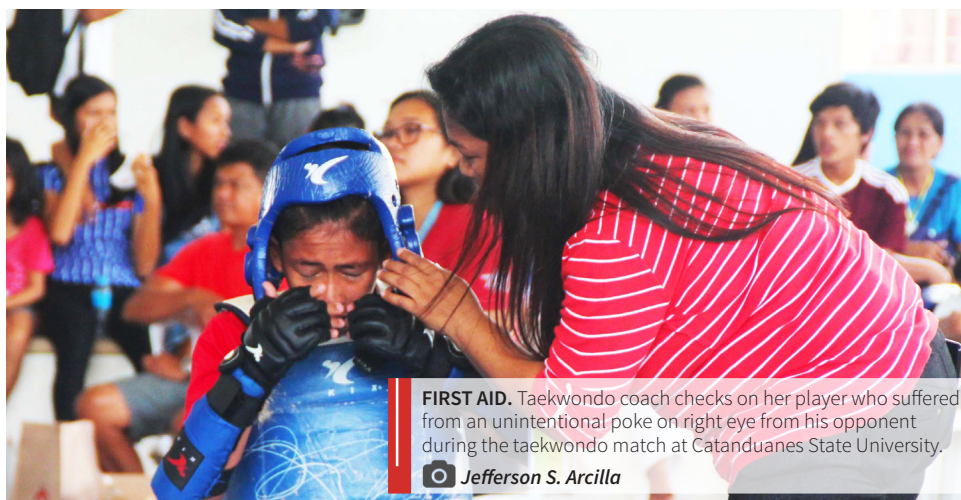
FIRST AID. Taekwondo coach checks on her player who suffered from an unintentional poke on right eye from his opponent during the taekwondo match at Catanduanes State University.

Ikan kaming routine and drills buda training bago mag Provincial Meet.