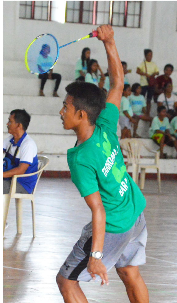
TOP FORM. Baras smasher is on his defensive stance while preparing for another lethal attack from his opponent in a badminton match for gold, October 31.