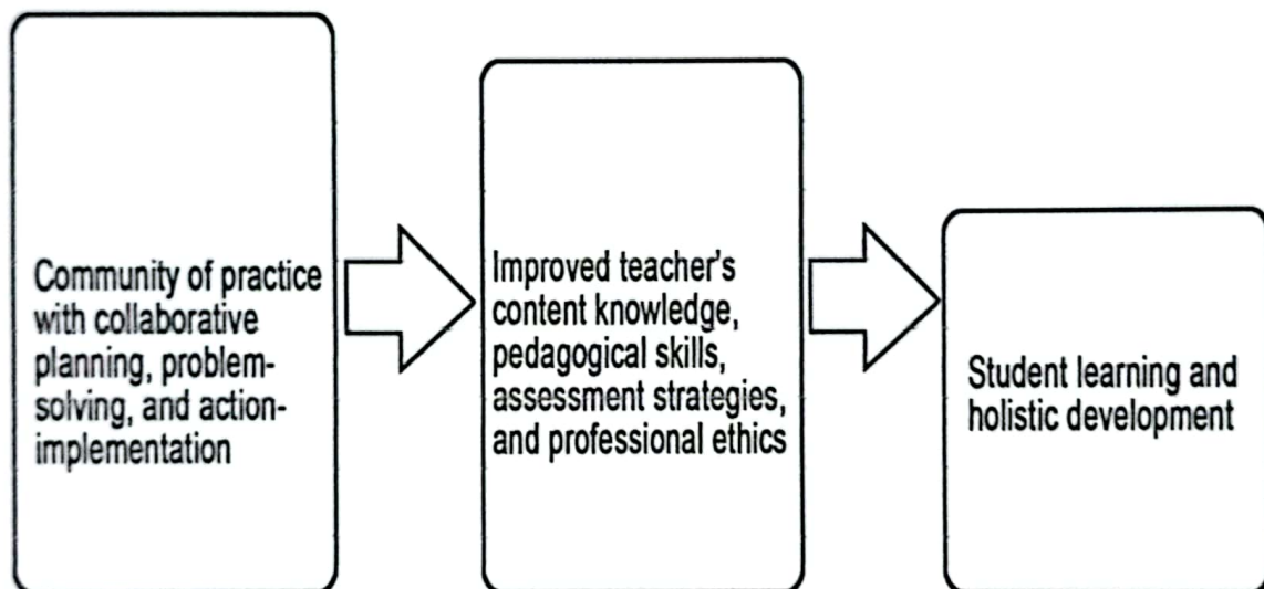
Figure 1. Theoretical Framework of the Learning Action Cell (LAC)

13. The theoretical framework in Figure 1 shows that communities of practice, in this case, LACs, enable teachers to do collaborative planning, problem solving, and action implementation that will lead to improved teachers' knowledge, skills, and attitudes that will consequently and significantly improve student learning and development.